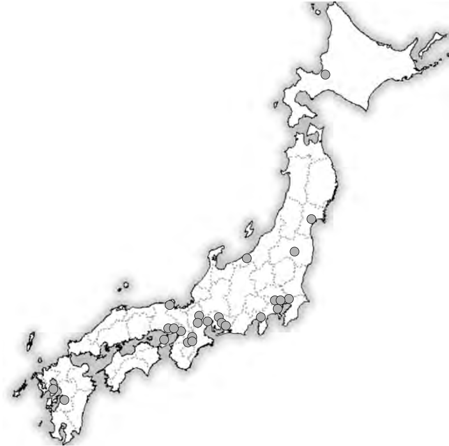
Fig. 1. Locations of groups constituting J-net.

or were engaged in cleaning (Kaneya, 1996). Emergent organizations were created as networks of these groups. Typical examples include local NGO support coordination councils and “Nishinomiya volunteer network”. Several other emergent organizations were created. Not many emergent organizations have, however, been continuing activities after the earthquake. Volunteer workers also participated in relief on such occasions as the Great Kanto Earthquake of 1923, Fukui Earthquake of 1948, Typhoon Ise Bay of 1959 (Noda, 1995; Urban Disaster Research Institute, Disaster Prevention Bureau, National Land Agency, 1987), and the pyroclastic flow disaster due to the eruption of Mt. Fugen, Nagasaki Prefecture in 1991 (Kanegae, 1993; Yamashita, 1994). Not many of such activities have been continued at normal